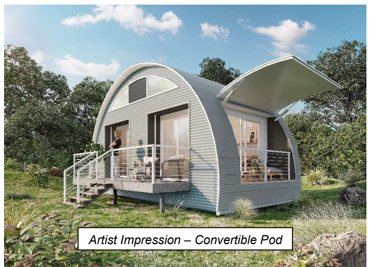
Artist Impression – Convertible Pod

(Note: subject to finishes and fittings selection)