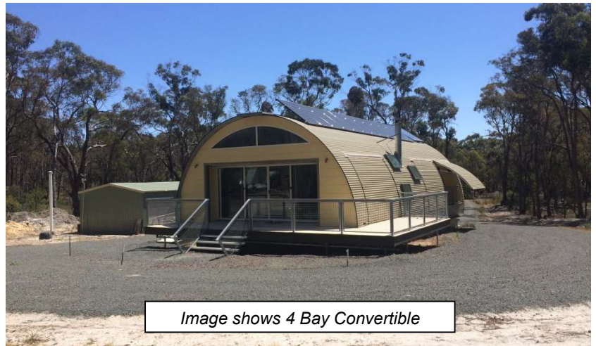
Image shows 4 Bay Convertible

Multi-Award Winning Bushfire & Storm Resistant Buildings