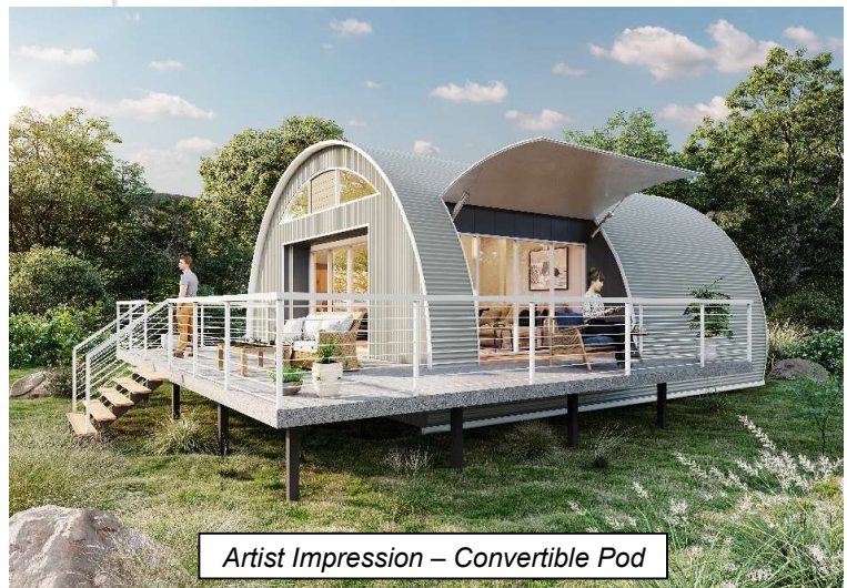
Artist Impression – Convertible Pod

Multi-Award Winning Bushfire & Storm Resistant Buildings