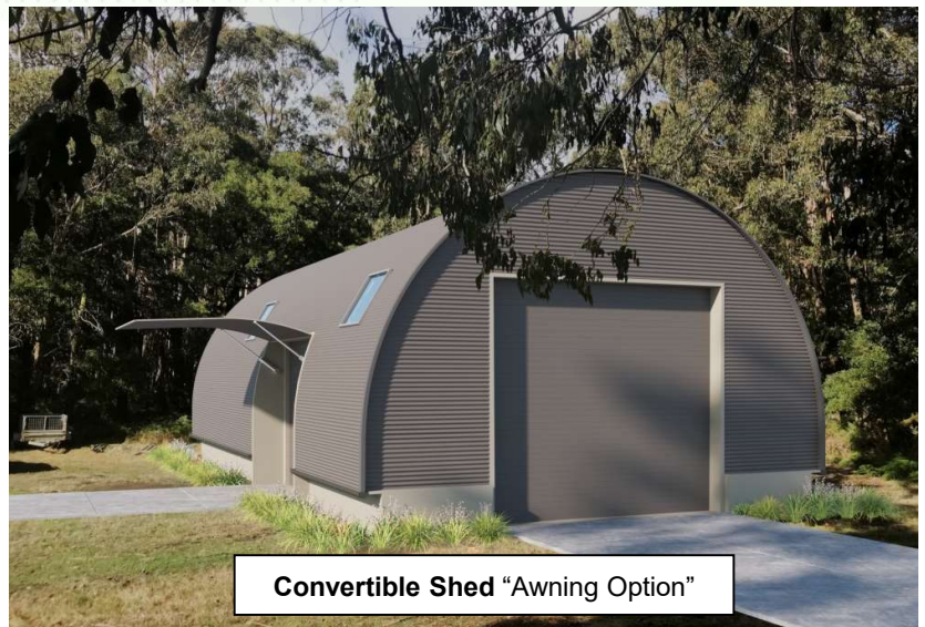
Convertible Shed “Awning Option”

(Note: Subject to finishes and fittings selection)